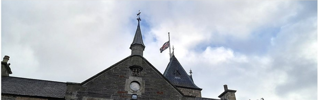
The Union Flag flies at half-mast over the Council Offices on the day of the funeral of HRH The Duchess of Kent.

A report from your "shortlisted" councillor.