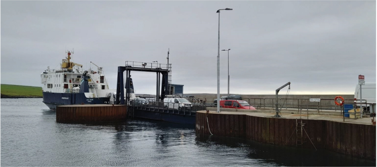
MV Earl Sigurd at Rapness

—connecting with constituents of the North Isles ward.