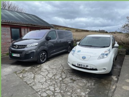
Our two community vehicles

REWDT, The Pier Cabin, Rousay, Orkney KW17 2PU Tel: 01856 821229 email: info@rewdt.org